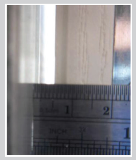
Measurement between door & straight edge

Please Note ; it is recommended that fabricators pass this information to their customers. This is to ensure that they do not invalidate the warranty by poor installations that will affect the performance of the door-set once installed.