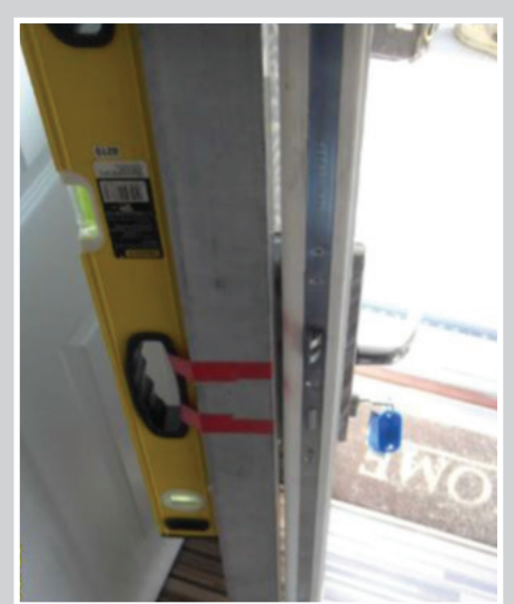
Straight edge on concave face